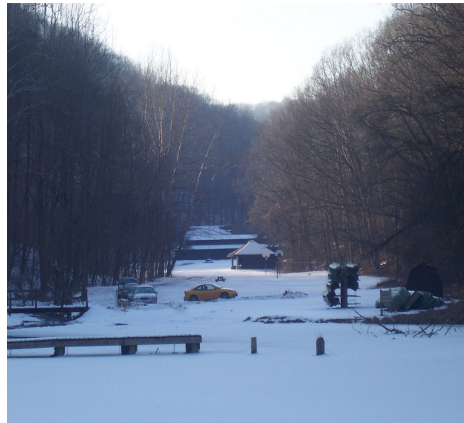
A snow covered Tar Hollow in late